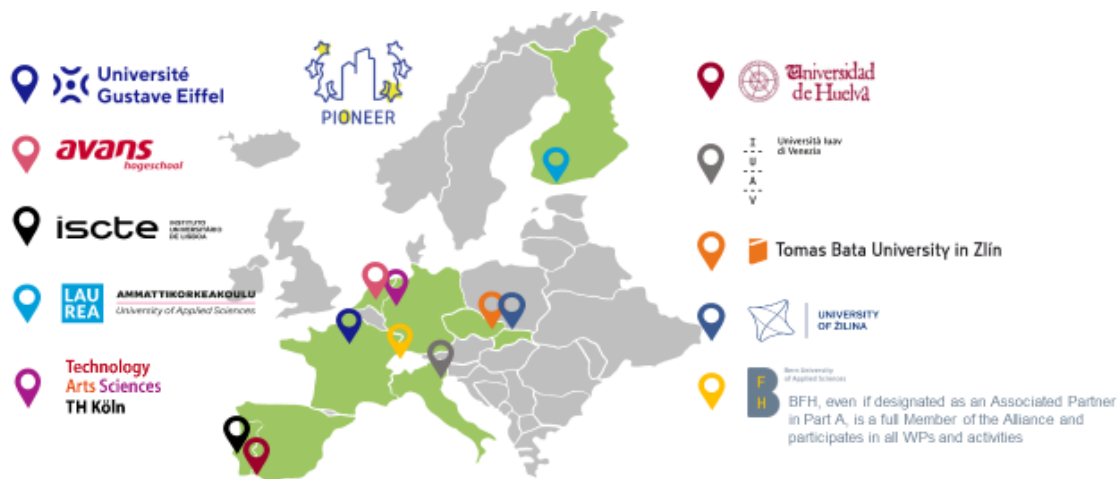
Figure 3: PIONEER Member institutions

PIONEER is built on the ongoing collaboration between its members, both in terms of student exchanges and European research and innovation projects 9 , and on our desire to take this collaboration further and develop activities that we could not undertake on our own. An example of this would be the strengthening of challenge-based education, which is central to our mission, the cross-boundary mutual engagement of ecosystems, and the power to tackle societal challenges that need to be addressed on a European scale, such as smart grids or the electrification of transport.