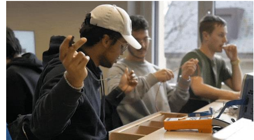
Engineering and Computer Science