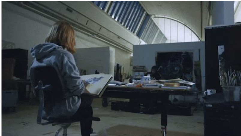
Bern Academy of the Arts